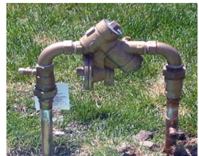
A typical unprotected backflow is easy to take. A covered one is more secure.

We have built our business on service and integrity. Our philosophy is simple; we strive to maintain the highest quality standards and to exceed your expectations. If there is ever a problem, we will do whatever it takes to make it right. Many companies may make this claim, but we live it. We are a locally owned company dedicated to servicing our customers. Our entire livelihood depends on the integrity with which we operate right here in the Denver area and we take great pride in our commitment to quality service.